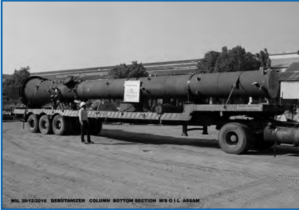
Debutanizer Column (Process equipment) being dispatched to OIL Assam from Walchandnagar