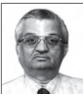
Dr. Anil Kakodkar Director