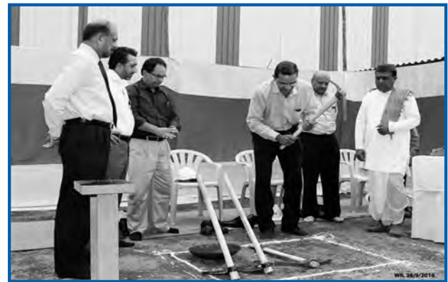
Dignitaries from ISRO present at the ground-breaking ceremony of the new Aerospace Equipment Testing facility at Walchandnagar